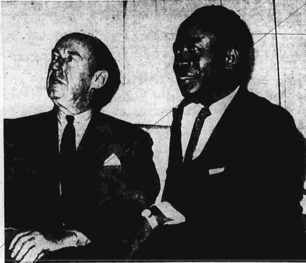
President Kwame Nkrumah of Ghana and Adlai Stevenson, U.S. ambassador to the United Nations, meet for breakfast this morning at Stevenson's suite in New York's Waldorf Towers. Nkrumah arrived yesterday by plane. He is scheduled to address the UN General Assembly tomorrow.

Washington, March 6 (AP)—A U.S. Navy task force has been turned back from a goodwill voyage and sent back to Congolese waters to be available in case the United Nations needs help there, the State Department said today.